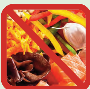
FOOD & TRASH