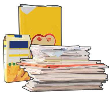
Paper (all colors and types) Papel (de todo color y tipo)