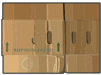
Cardboard (flatten) Cartón (desarmado)