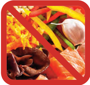
FOOD & TRASH

DO NOT place any of the following items in your recycle bin. DO NOT bag recyclables.