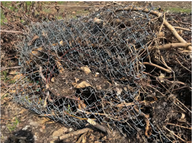
Oma-Gro composting facility routinely deals with non-compostable items like garden hoses and fencing.

misuse has made it increasingly difficult to find new host locations for drop-off sites, which is why the City has yet to secure a new central site.