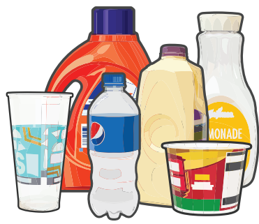
Plastic Bottles, Jars, Jugs, and Cups (empty and clean) Botellas de plástico, tarros, Jarras y tazas (vacíos y limpios)