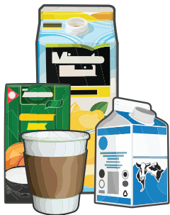
Food Cartons and Cups (empty and clean) Cartones de comida y tazas (vacíos y limpios)