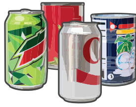
Aluminum and Steel Cans (empty and clean) Latas de aluminio y acero (vacías y limpios)