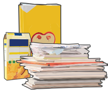
Paper (all colors and types) Papel (de todo color y tipo)