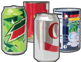
Aluminum and Steel Cans (empty and clean) Latas de aluminio y acero (vacías y limpios)