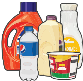
Plastic Bottles, Jars and Jugs (empty and clean) Envases de plástico (vacíos y limpios)