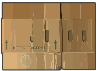
Cardboard (flatten) Cartón (desarmado)