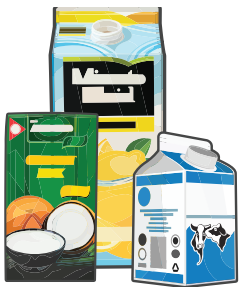
Food Cartons (empty and clean) Cartones de comestibles (vacíos y limpios)