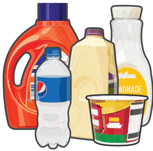
Plastic Bottles, Jars and Jugs (empty and clean) Envases de plástico (vacíos y limpios)