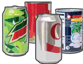
Aluminum and Steel Cans (empty and clean) Latas de aluminio y acero (vacías y limpios)