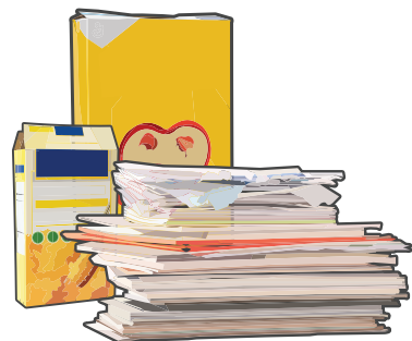
Paper (all colors and types) Papel (de todo color y tipo)