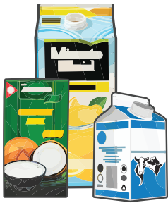
Food Cartons (empty and clean) Cartones de comestibles (vacíos y limpios)