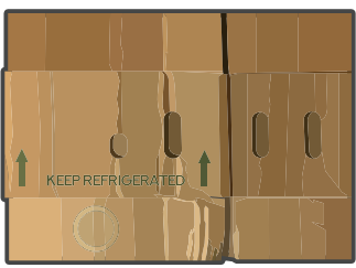
Cardboard (flatten) Cartón (desarmado)